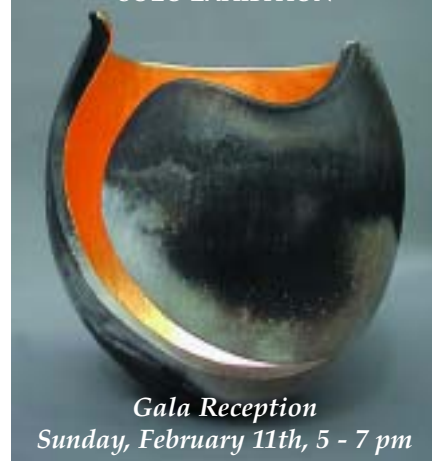
Gala Reception Sunday, February 11th, 5 - 7 pm