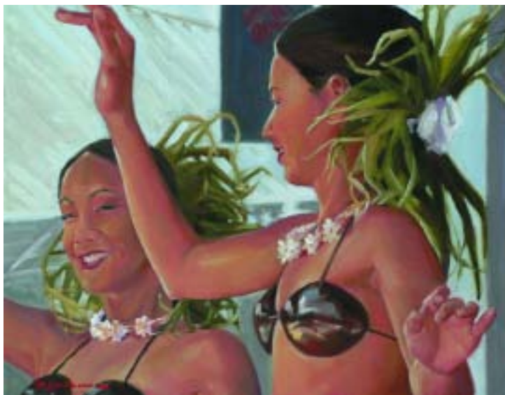
Kirk Kurokawa: Hula Girls , Oil, 11" x 14", $1,500

Art Night Reception: Friday, March 30th, 6 - 9 pm