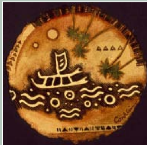
Cindy Conklin Petroglyph Circle 6" D Watercolor $350

CINDY CONKLIN • ARTIST-IN-RESIDENCE Exhibition Reception Sun., May 20th, 4 - 6 pm May 21 & 22 "Hands-on" Watercolor with Cindy