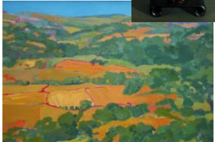
George Brinner Hailiimaile 20" x 30" Acrylic $1,500

An array of wood in various styles, from bowls to sculpture, will add another dimension to this fine show.