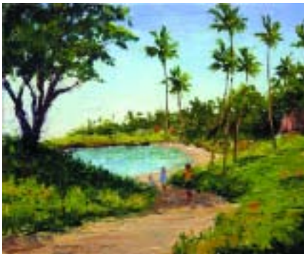
George Allan Kapalua Path Oil 10" x 12" $1600

We enthusiastically invite you to attend the second annual Maui Plein Air Painting Invitational presented by "Islanders", a contemporary plein air group focusing on recording the life and landscape of Hawaii.