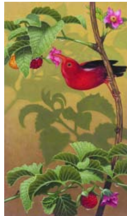
N. Robert Wagstaff Tapestry S/N Giclée on Canvas 19.75" x 11.5" $220

Our artists are finding giclée prints an exciting new venue for reproducing their work. The images featured are printed on watercolor paper or canvas with the finest archival inks. Prices are unframed plus shipping. Complimentary shipping when sending two or more prints to one address. Please call to order 800.346.0585 or 800.660.1500 Online, visit us at villagegalleriesmaui.com