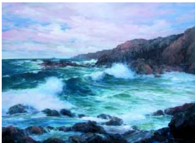
Joyce Clark Summer Surge II Oil 30" x 40", $9,500

Subject to change, please call to confirm current schedule 669-1800