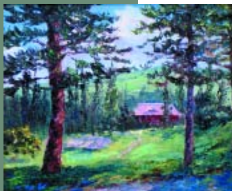
B. H. Freeland Honolua Village, Kapalua Oil painted en plein air, 10" x 12", $1,350