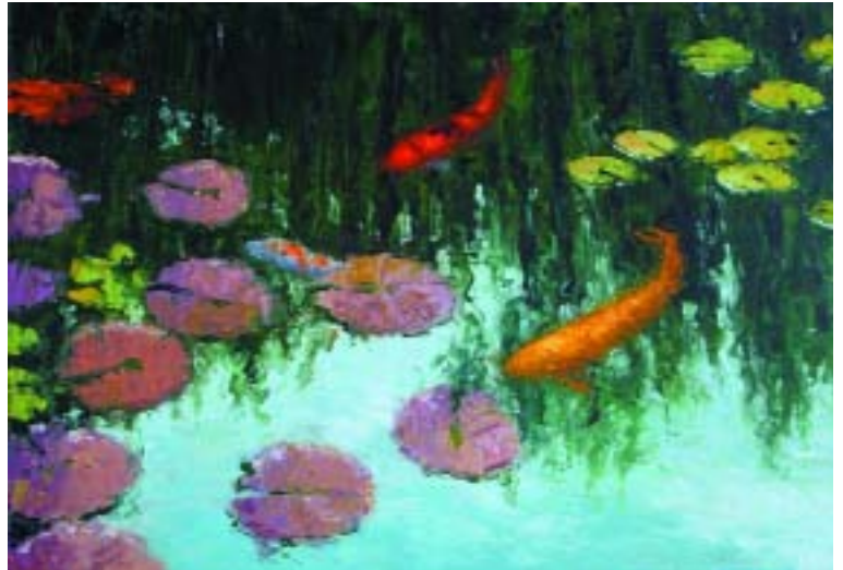
George Allan: Koi Partners , 10" x 15" Oil, $1,900

Art Night Reception: Friday, February 16th, 6 - 9 pm