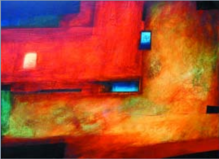
Stuart Sharp Shelter 30" x 40" Acrylic $1,950

MARCH 23 - APRIL 12, 2007 CONTEMPORARY - 180 DICKENSON STREET Art Night Reception: Friday, March 23rd, 6 - 9 pm STUART SHARP