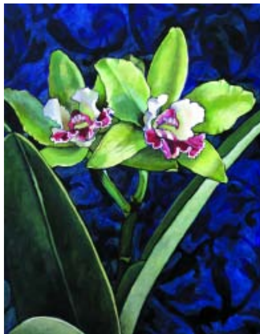
Tracy Dudley Oma'oma'o Orchid Acrylic 30" x 20" $2,800

Art Night Reception: Friday, April 20th, 6 - 9 pm