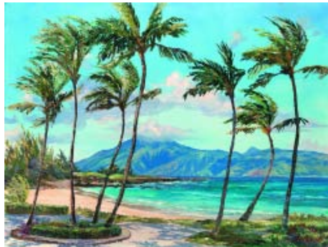
B. H. Freeland: Beach at the Ritz, Original Oil, 30" x 40" $10,500 framed S/N Giclée on Canvas available in three sizes 9" x 12" @ $250 20" x 26" @ $600 30" x 40" @ $1200

Our artists are finding giclée prints an exciting new venue for reproducing their work. The images featured are printed on watercolor paper or canvas with the finest archival inks. Prices are unframed plus shipping. Complimentary shipping when sending two or more prints to one address. Please call to order 800.346.0585 or 800.660.1500 Online, visit us at villagegalleriesmaui.com