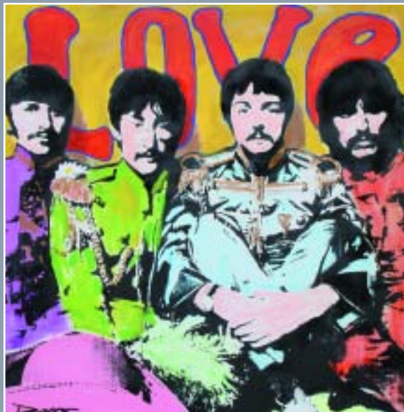
Davo All You Need Is Love 48" x 48" Mixed Media $3,400