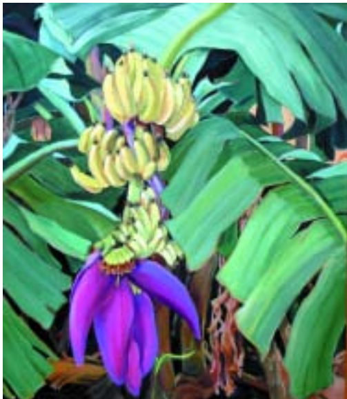
Suzanne de Cillia Bananas 32" x 28" Acrylic $3,400

Art Night Reception: Friday, May 4th, 6 - 9 pm