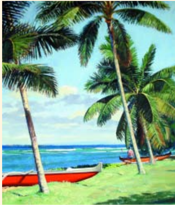
Carleton Lahaina Racers Oil 32" x 38" $3,800

Art Night Reception: Friday, Jan.5th, 6 - 9 pm