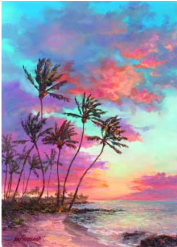
B. H. Freeland: Maui Splendor , Oil, 28" x 20" $4,800 Giclée Available

Art Night Reception: Friday, January 26th, 6 - 9 pm