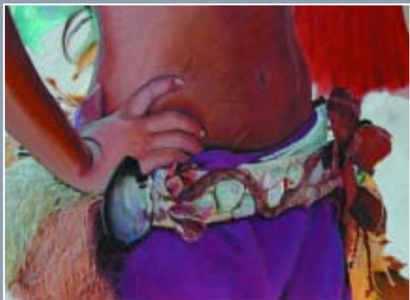
S. Papanikolas Tahitian Shell Belt 30" x 40" Acrylic $4,000 Giclée Available

Art Night Reception: Friday, February 2nd, 6 - 9 pm