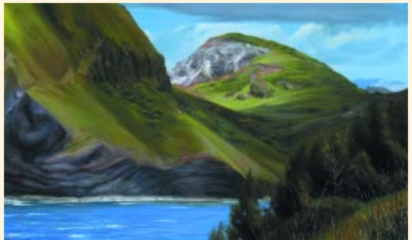
Kit Gentry Kahakuloa Countryside Oil 12" x 20" $6,500

Join us January 5th at our festive reception for these two great artists.