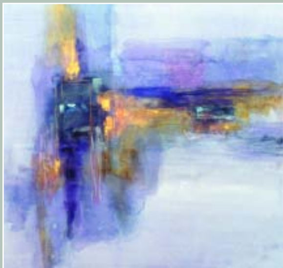
Fred KenKnight: Touch of Gold Watercolor, 19" x 19", $850

Exhibition Reception Sun., Jan. 28th, 4 - 6 pm Jan. 29 & 30 "Hands-on" Watercolor with Fred