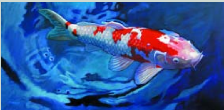
Tracy Dudley: Weeping Banyan Koi Series S/N Giclée on canvas 12" x 24" @ $475.