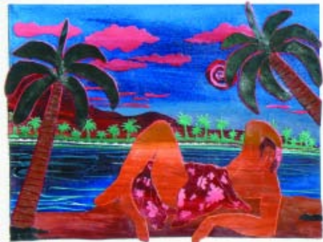
Claudia Coonan Sunset on the Rocks 12" x 15" Collage $900

Art Night Reception: Friday, May 25th, 6 - 9 pm